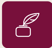
Shared poetry reading