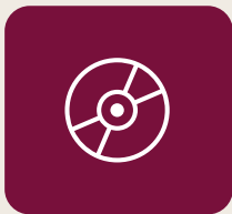
Desert island discs