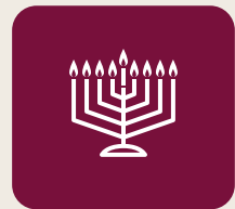
Jewish cultural focus