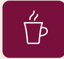
Coffee morning socials