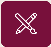
Practical art groups