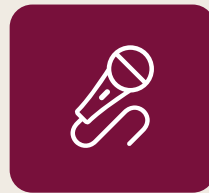
Guest speakers & performers