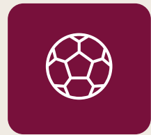
Watching the premier league