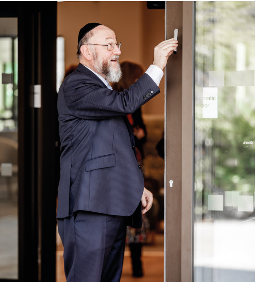
May 2021, Chief Rabbi Ephraim Mirvis performs the Chanukat Habayit ceremony

If you would like to know more, our Residents Services team will be happy to assist on 020 8673 3495 or ResidentsServices@nightingalehammerson.org