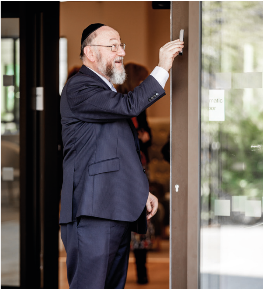
May 2021, Chief Rabbi Ephraim Mirvis performs the Chanukat Habayit ceremony

If you would like to know more, our Residents Services team will be happy to assist on 020 8673 3495 or ResidentsServices@nightingalehammerson.org